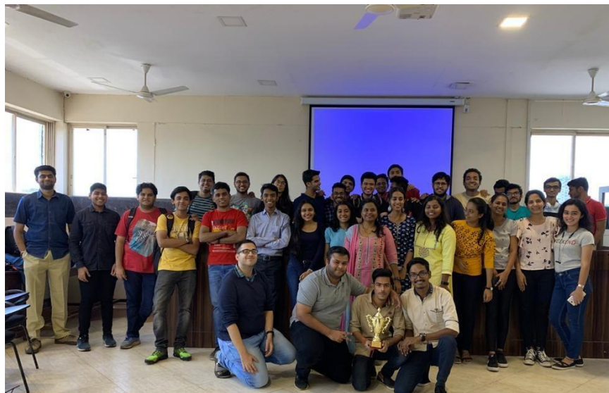
The winning team with the entire EBSB Committee of TSEC